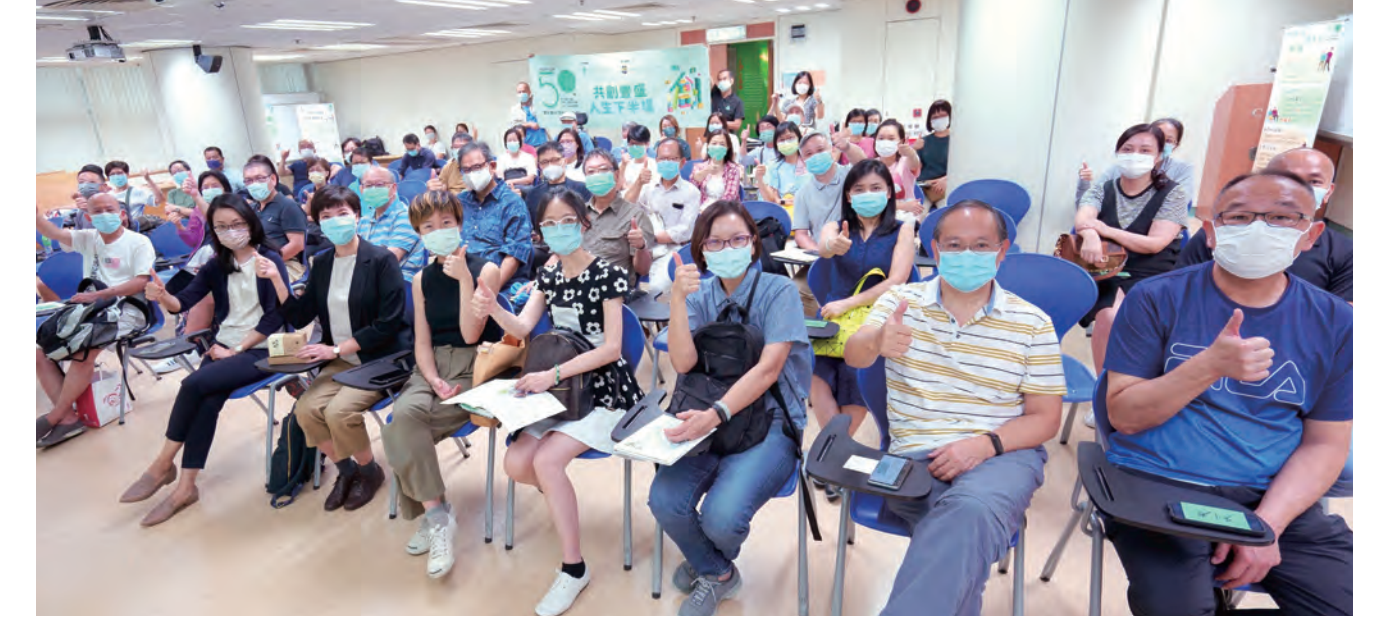
「香港輔助專業人員計劃」定期舉辦退休講座。 Retirement talks were regularly held as part of the "Hong Kong Auxiliary Professional Scheme".